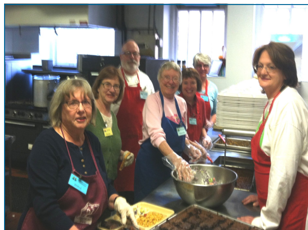
Highland Park joins other faith communities at University Baptist for two hours on Thursdays to serve 150-250 hungry people at God's Family Dinner, part of Micah 6