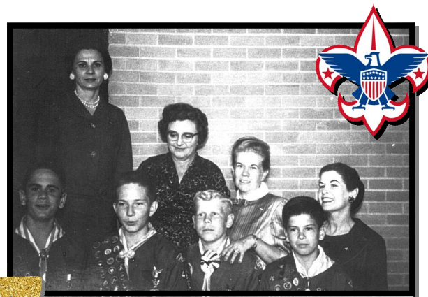
First scouts of Troop 410 (Recognize anyone?)

60 years ago... Boy Scouts Troop 410 was first chartered at Highland Park in July of 1956.