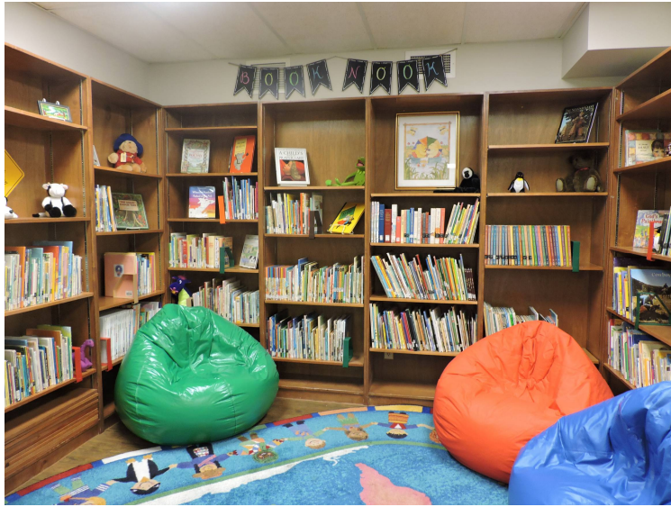
Children's library, with doors to both the library and the children's Sunday School hallway

These photos only capture a portion of the work done the last few months. Stop by and see!