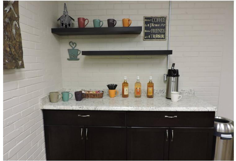
Coffee bar in the Oletha Sapp Library