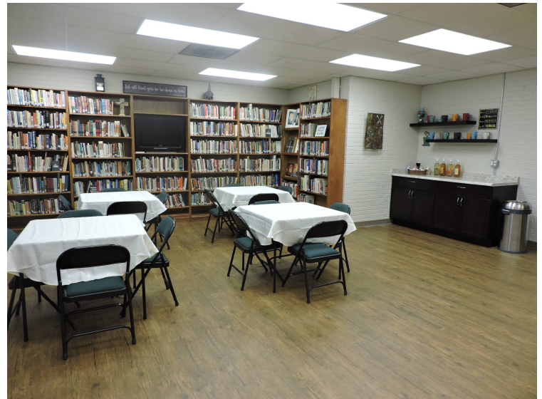
Tables and chairs near the coffee bar