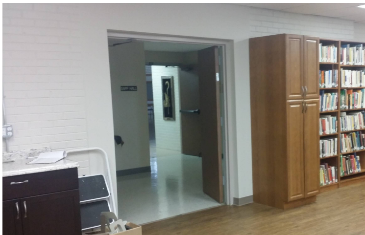
A new door opens to the hallway just outside Sapp Hall