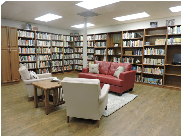
New, more spacious layout and new flooring