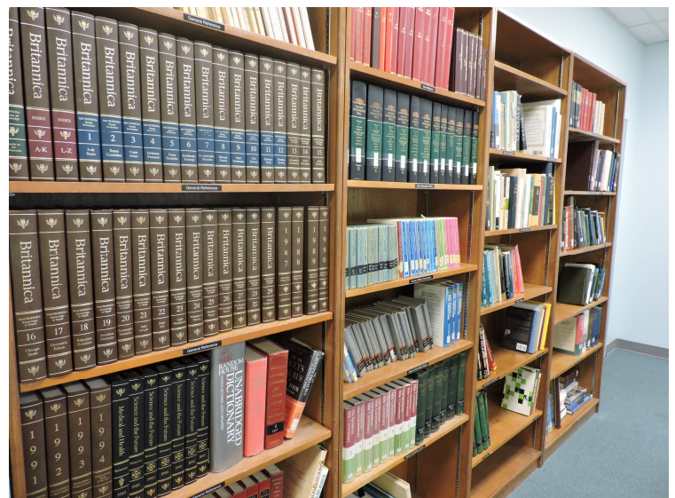
The John Miller Reference Library upstairs