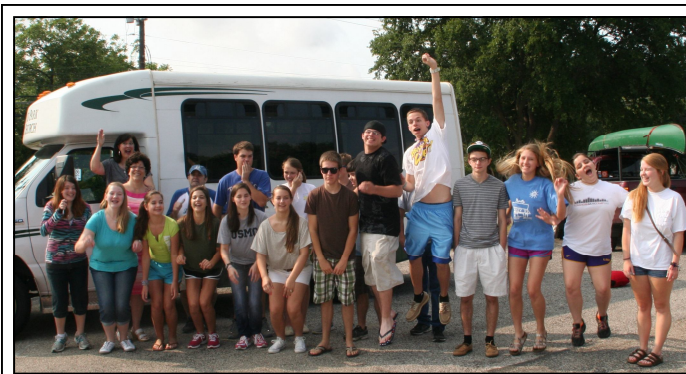
With a little Youth Camp and Children's Camp thrown in for good measure.