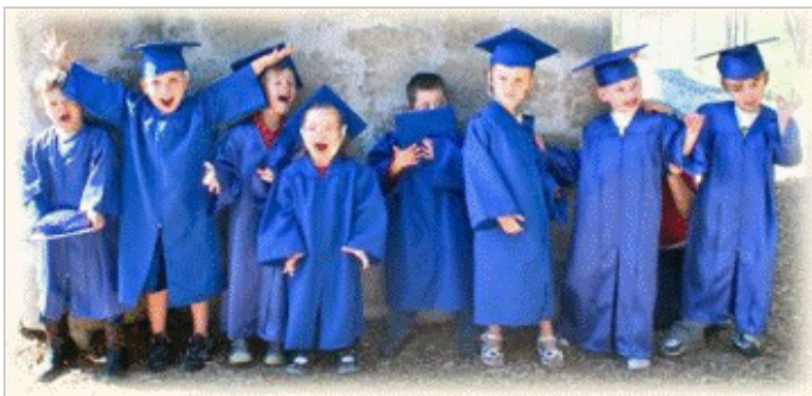
Congratulations to Rise School Class of 2012 — our newest graduates