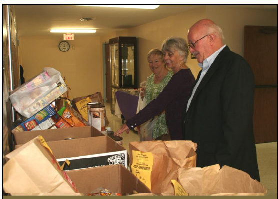
Sorting Share Your Table food donations For Baptist Community Center Food Drive