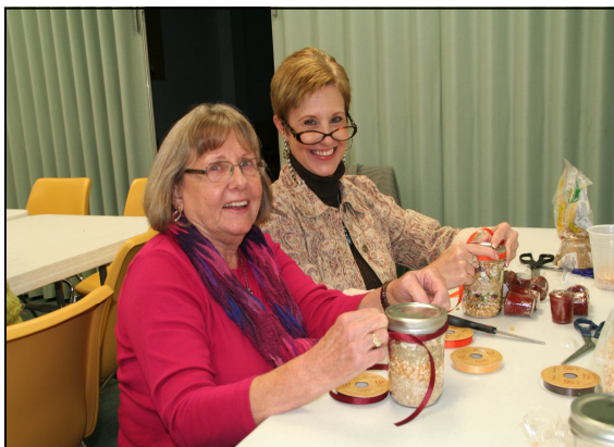
Making and decorating candles at S.I.S. for Open Door Ministry