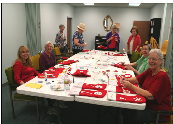
Making and decorating stockings for Baptist Community Center