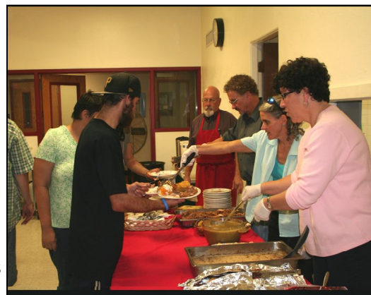
Hosting and serving Dinner at Micah 6 Youth Drop-In on Sunday afternoons