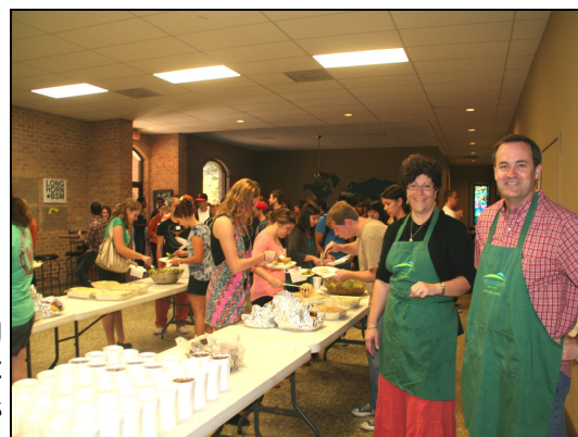
Preparing and serving lunch at UT Baptist Student Ministries