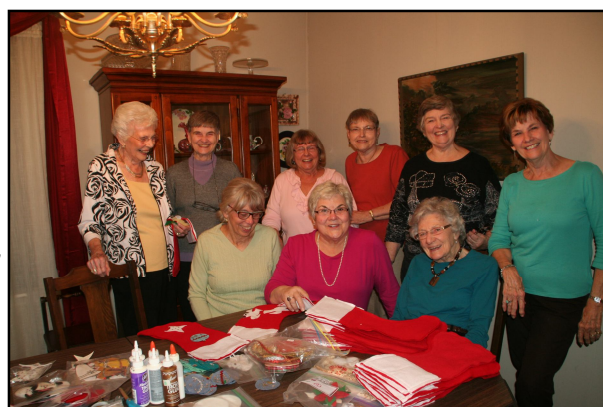
S.I.S. WMU making stockings for Baptist Community Center Mission