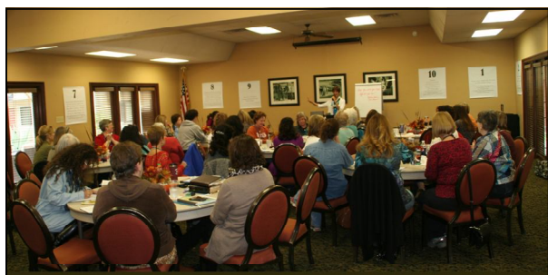
Womanfest in October in Fredericksburg