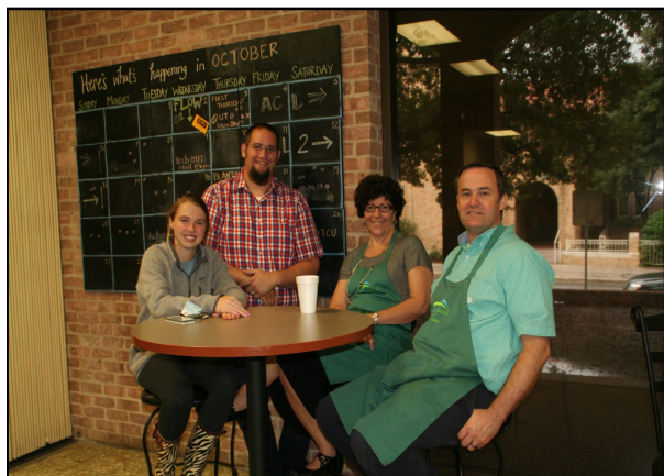
Serving lunch with S.I.S. WMU at Baptist Student Ministry