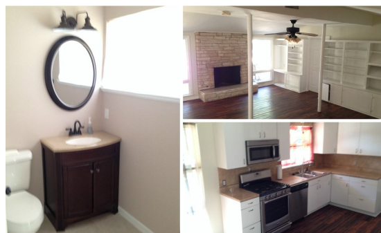
Photos of the renovated property

Thanks to everyone who has had a hand in this adventure and to the One who brings us together as family and is our Home.