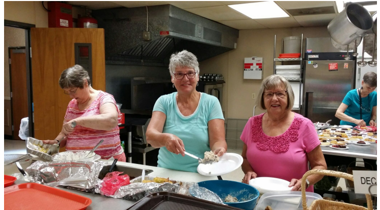
Sisters in Service serve a meal at Senior Day Out on August 27 at Drive a Senior Northwest

Prayer Breakfast moved during the month of October to Russell's. The group will be back in Sapp Hall for the month of November, and will not meet the Friday after Thanksgiving or on Christmas Day.