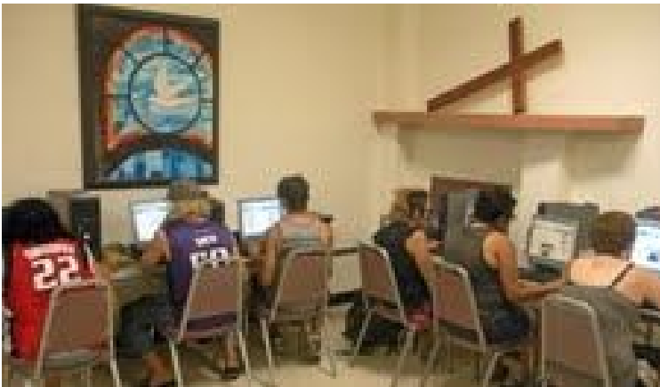
Computer lab at the Micah 6 Street Youth Drop-In Center

The Micah 6 Street Youth Drop-In center has been in operation nearly four years, ministering to young people up to the age of 30.