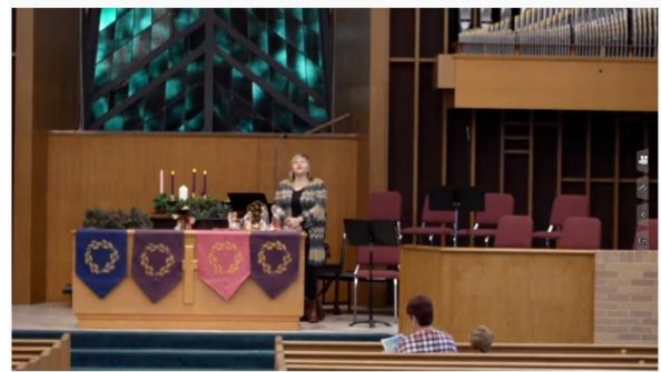
Worship of God on the Third Sunday of Advent