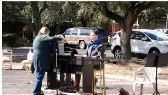
Worship of God on the First Sunday of Advent