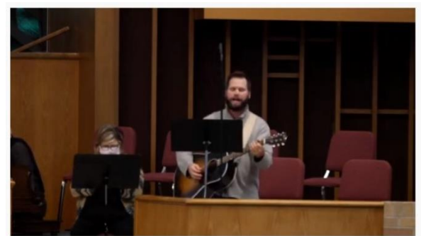
Worship of God on the Third Sunday of Advent