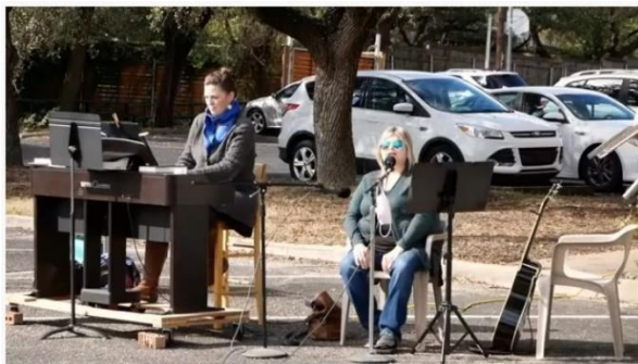
Worship of God on the First Sunday of Advent